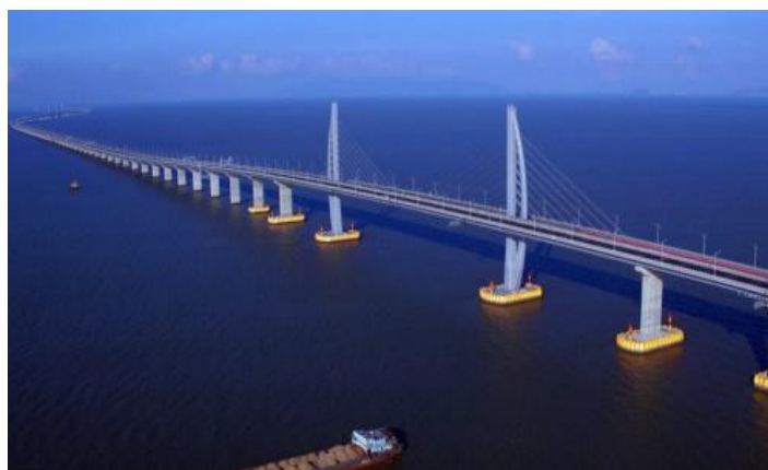
Hong Kong-Zhuhai-Macao Bridge

Previously Portuguese Colony, the beautiful city of Macao is located on the western side of the Pearl River estuary in East Asia. Known as the 'Vegas of China', Macau is indeed an epicenter of gambling and glitz. While luxury entertainment here is world-class, the city has much more to offer than that. The city has started international trade and cultural exchange activities at a very early age. It is in good geographical condition with natural deep water port. Macau becomes an important node in national Maritime Silk Road due to its transportation advantage. With the opening of Hong Kong-Zhuhai-Macao Bridge, it is connected with the world's liveliest economic region. The construction of the express will have profound significance of economy and society integration in Hong Kong, Macao and Zhuhai.